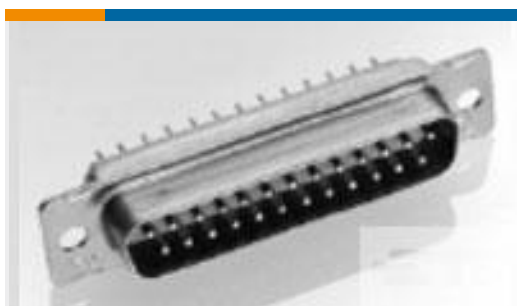
TE Part # 1757824-1 AMPLIMITE,ASY,RCPT,STD,90,ZN,1