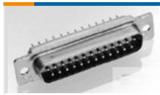
TE Part # 1757824-9 AMPLIMITE,ASY,RCPT,STD,90,ZN,3,CT