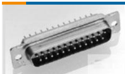
TE Part # 1757824-2 AMPLIMITE,ASY,RCPT,STD,90,ZN,2