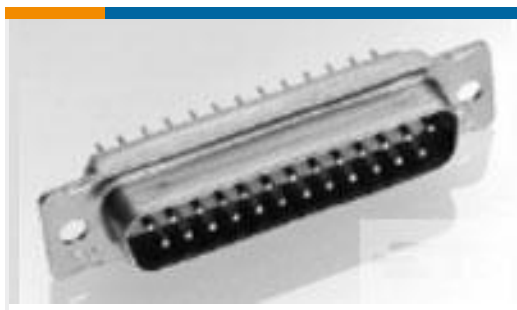
TE Part # 1757824-8 AMPLIMITE,ASY,RCPT,STD,90,ZN,2, CONT